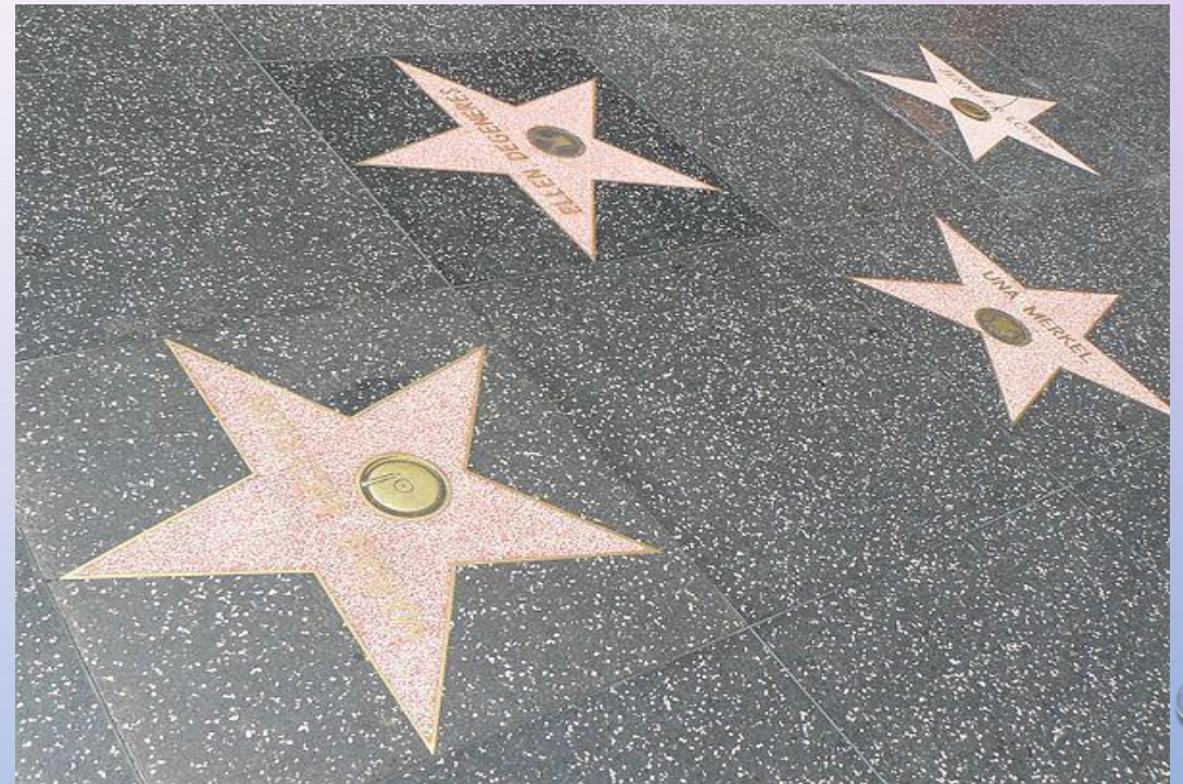
The Walk of Fame