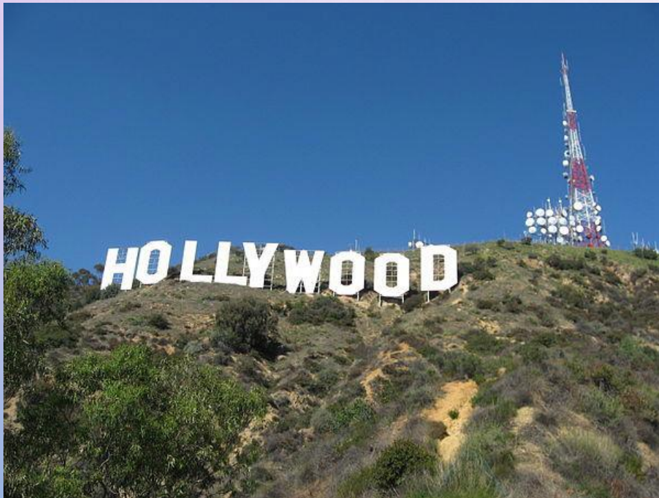
The Hollywood Sign