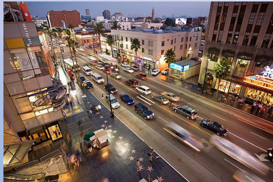
Hollywood Boulevard from the Dolby Theatre, before 2006